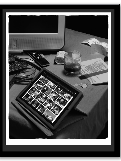
TECHNICS #5 (16"20" image)